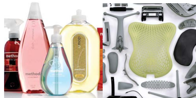
Biological nutrients: Method

To apply those principles, Cradle to Cradle® focuses on optimizing the intended use of a product. It distinguishes between two main intended pathways that products follow: consumption pathways where products are designed to safely enter biological systems, and service pathways where products safely enter technical systems to be part of new, future product generations.